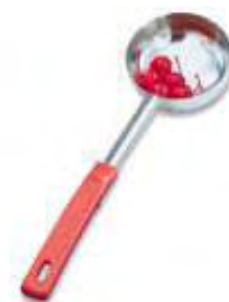
Spoodle serving utensil