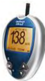
One Touch Ultra