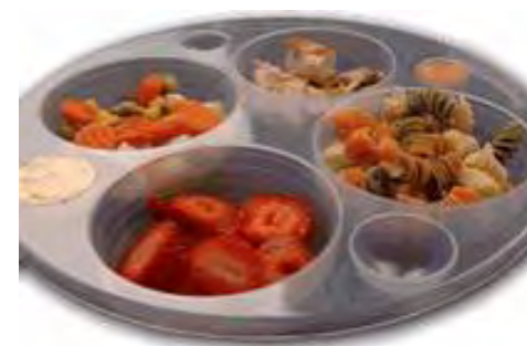
Plate with tactile portion templates

Accessing printed information on food labels is also necessary for healthy eating, especially when counting carbohydrates. It's possible to obtain nutrition information by using any of the following methods and adaptations: