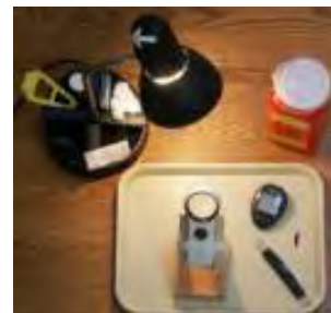
Lamp and tray for contrast