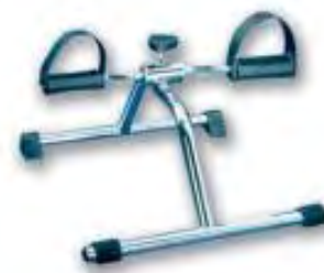
Tabletop arm bike

Several online resources and publications specifically address physical activity and exercise for individuals who are blind or have low vision: