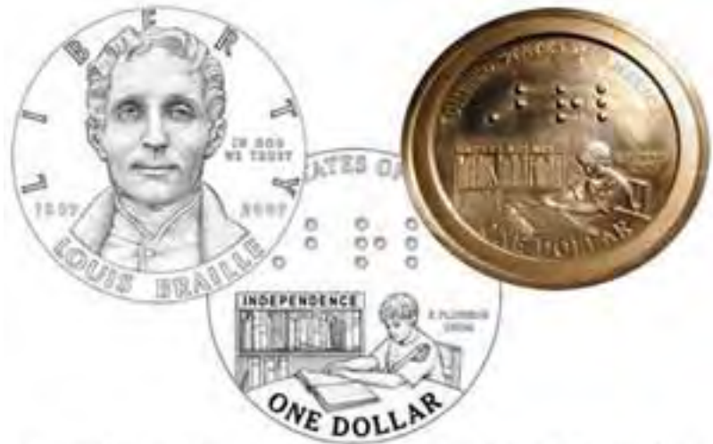
Artist renderings of the 2009 Louis Braille Bicentennial Silver Dollar coin design and a photo of its prototype reverse.

The first American coin with tactual braille characters is a silver dollar commemorating the 200th anniversary of the birth of Louis Braille. The "heads" side of the coin depicts Louis Braille with the word "Liberty" above it. On the flip side, the braille code for the word "braille" is inscribed above a depiction of a boy reading a braille book. The new coin will be available in Spring 2009.