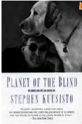
Planet of the Blind by poet Stephen Kuusisto