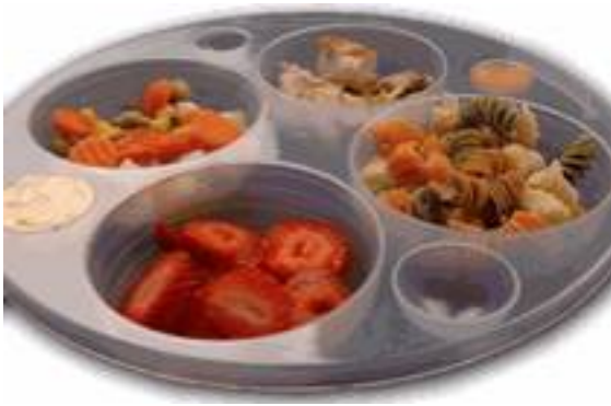
Plate with tactile portion templates