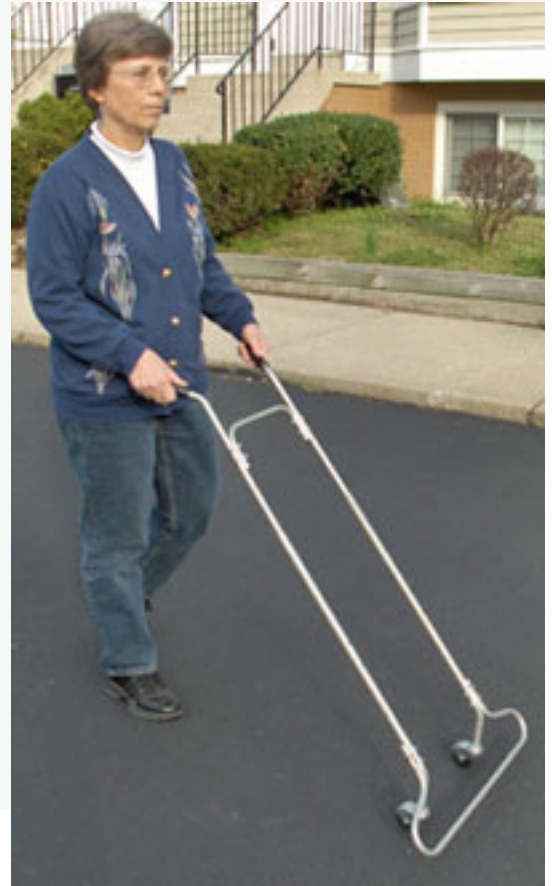
Outdoor travel with an alternative mobility device

For more information, see Alternative Mobility Device .