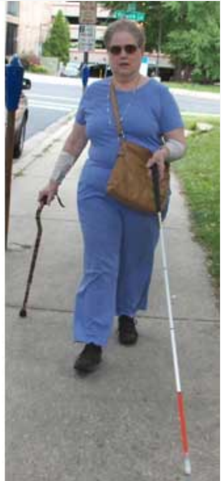
Left: One type of support cane