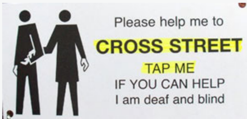
A street-crossing card for deaf-blind individuals

A primary orientation and mobility (O&M) challenge for individuals who cannot hear or see well is learning to communicate effectively with people who can provide help or information, such as store personnel, bus drivers, police, and pedestrians.